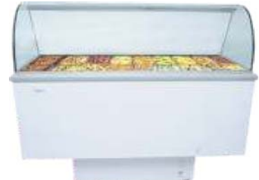
Island Freezer with indigenous glass canopy (Glass canopy not supplied with the Freezer)