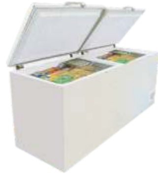
Double Lid Chest Freezer / Chiller CF-500