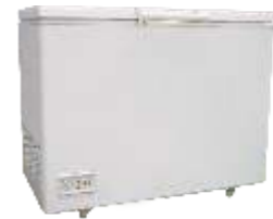
Chest Freezer / Chiller CF-300