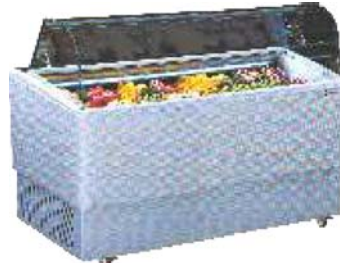
Gelato Showcase Samoa 7